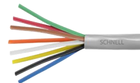
DIAGRAM & CONSTRUCTION

SCHNELL 8-Core 20 AWG Unshielded Multi-Conductor Cable is ideal for control, signaling, and industrial applications. It features stranded copper conductors with PE insulation and a flexible PVC or LSZH outer jacket. With reliable mechanical durability and low capacitance, it is well-suited for building automation, audio, and instrumentation installations.