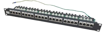
DIAGRAM & CONSTRUCTION

High-performance CAT-6A S/FTP 24-port patch panel in 1U height for standard 19" racks. Features full pair foils plus overall braided shield for excellent EMI suppression. Designed for 10 Gigabit Ethernet, supports PoE++ and robust termination tools, combined with rear cable management for organized setups.