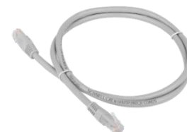
DIAGRAM & CONSTRUCTION

Schnell Category 6A U/UTP patch cords deliver high-performance networking with reduced insertion loss and minimal alien crosstalk. Tested up to 500 MHz, they support 10 Gigabit Ethernet and are fully compatible with protocols like 1000BASE-T, 100BASE-T, 10BASE-T (IEEE 802.3), Token Ring (IEEE 802.5), 100VG-AnyLAN, TP-PMD, ATM (55/155 Mbps), and voice applications.