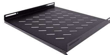
DIAGRAM & CONSTRUCTION

Heavy-duty 1 U fixed shelves for 19" rack cabinets, available in four nominal depths (450, 600, 800 and 1000 mm). Made from cold-rolled steel with black powder coating. Designed to support non-rackmount equipment securely, with excellent load capacity and optional ventilation in deeper variants.