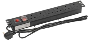
DIAGRAM & CONSTRUCTION

The SCHNELL Power Distribution Unit delivers dependable AC power to rack-mounted equipment. Built to meet the needs of IT, AV, telecom, and industrial environments, it features 6 to 15 universal sockets, a main power switch, and thermal circuit protection. The 1U design fits standard 19" racks and is ideal for organized and safe energy distribution in demanding installations.