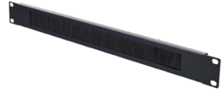
DIAGRAM & CONSTRUCTION

The SCHNELL 1U Brush Panel is designed for effective cable management in 19" rack systems. It features a high-density nylon brush strip to route cables neatly while minimizing dust intrusion and preserving front-to-back airflow. Constructed from cold-rolled steel with a black powder-coated finish, it ensures durability and a clean professional appearance.