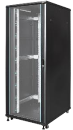
DIAGRAM & CONSTRUCTION

SCHNELL Floor Standing Server Racks are designed to support high-density cabling and equipment installations. Built with SPCC cold rolled steel and a static load capacity of 800 kg, the racks are compliant with global standards and offer removable side panels, over 180° opening front doors, multiple cable entry points, and enhanced airflow. Ideal for secure and scalable IT environments.