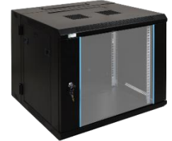
DIAGRAM & CONSTRUCTION

SCHNELL double section wall mount cabinet is designed for secure, space-efficient installation of networking and telecom equipment. It features a swing-out rear section for easy cable access, a lockable front glass door, and removable side panels. Built from cold-rolled steel, it ensures reliable equipment protection in office, data center, or industrial environments.