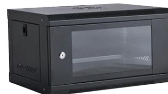
DIAGRAM & CONSTRUCTION

SCHNELL Single Section Wall Mount Cabinets are ideal for office and network environments. Constructed from 1.2mm SPCC cold rolled steel and powder-coated for durability, these cabinets support 19" standard equipment with welded frames, removable side panels, and cable entry from both top and bottom. Available in multiple U sizes with secure locking front doors and easy mounting.